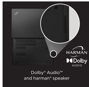
Dolby® Audio™ and harman® speaker