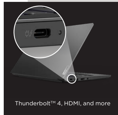
Thunderbolt™ 4, HDMI, and more