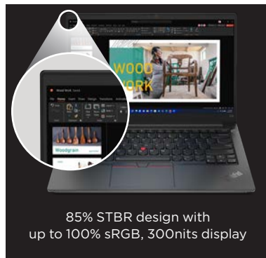
85% STBR design with up to 100% sRGB, 300nits display